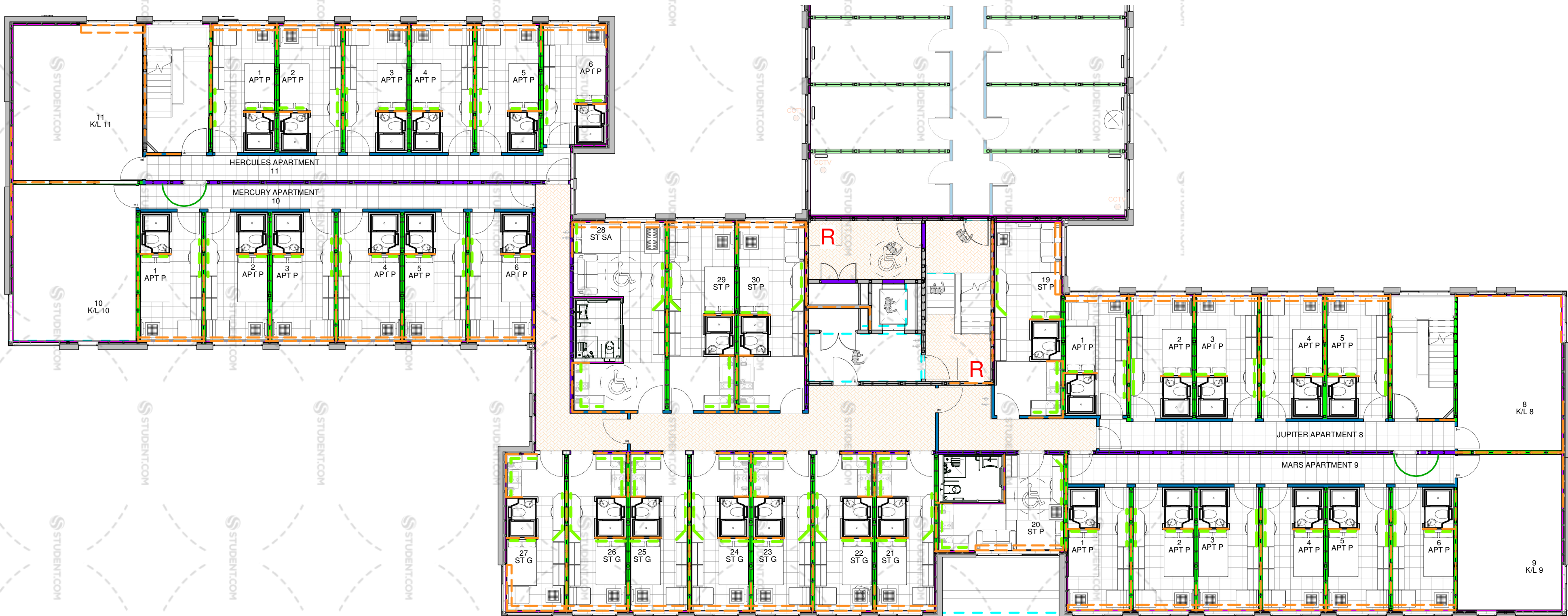
1 SI Level 1 MARKETING PLAN 1 : 125